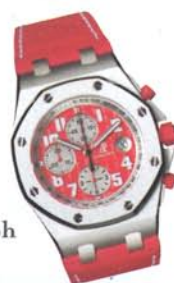
Still life by Jens Mortensen. Illustration by Bo Lundberg

Although its name is a mouthful, this limited edition Audemars Piguet Royal Oak Offshore Rhône-Fusterie Chronograph is elegantly simple. Water-resistant to 100 meters, it's ideal for all your land and sea pursuits (888-214-6858).